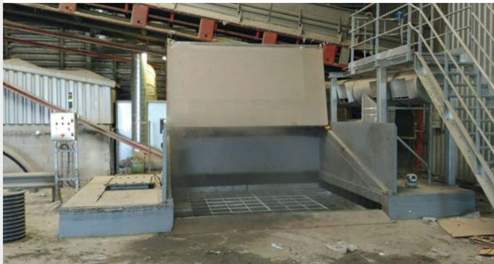
Sludge receiving bunker with typical Putzmeister A-fold lid