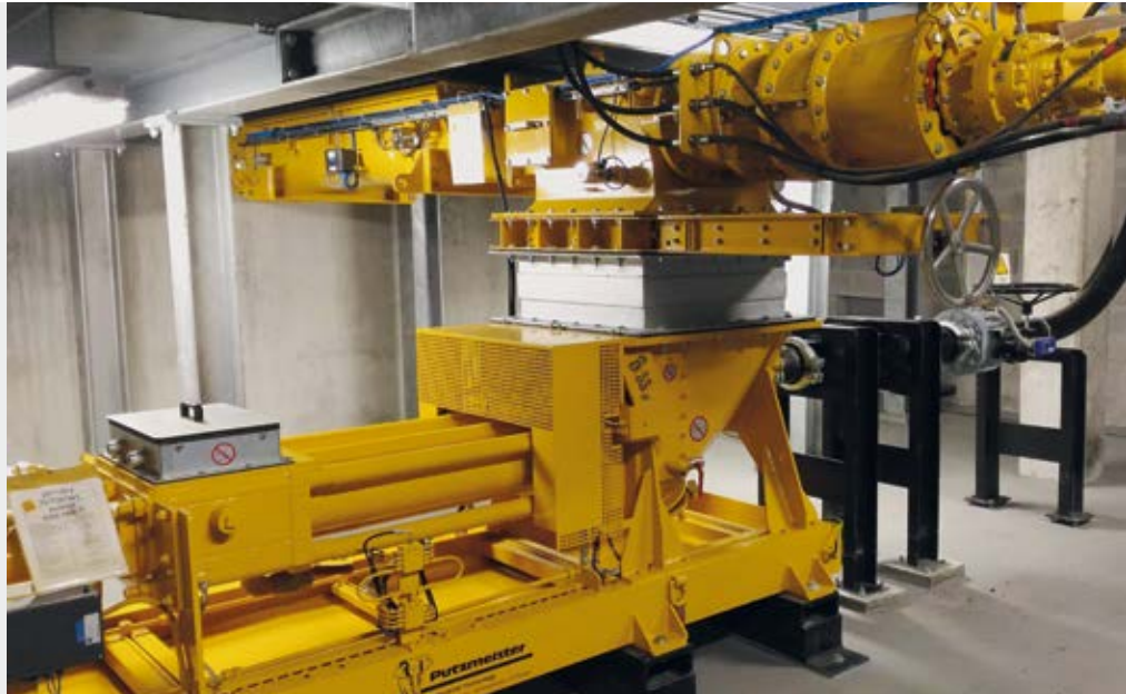
Silo discharge screw SHS 3132 SH feeding the KOS 1040 double-piston pump with S-transfer tube