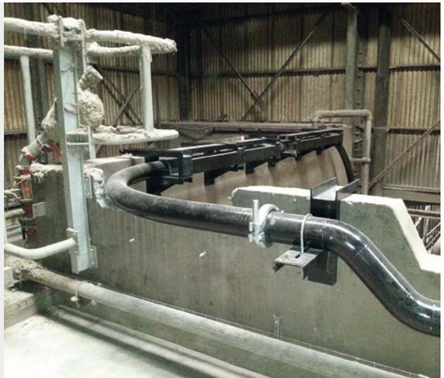
Sludge delivery line with Putzmeister ZX coupling system