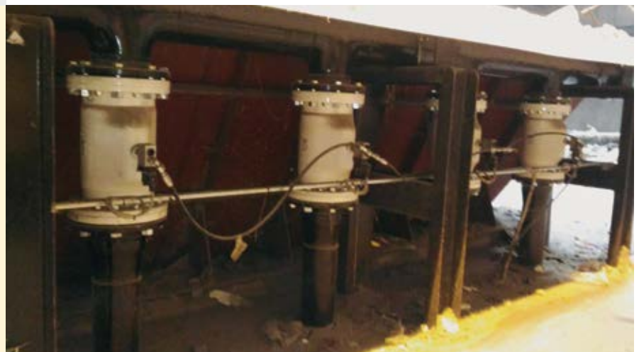
The sludge is distributed by 4 pinch valves to the hopper of the kiln